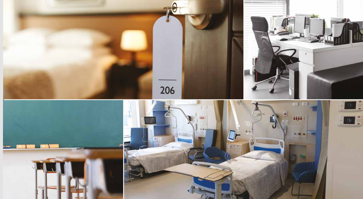
Examples of possible client applications: hotels, offices, schools, hospitals

UpSens innovation is built on solid foundations. Indeed, our company is a spin-off from a company with more than 20 years of experience in developing sensors for the biomedical, aerospace and manufacturing sectors. Thanks to this know-how, UpSens sensors are reliable scientific detection devices .