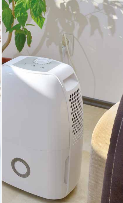
Customization options: kitchen extractor hoods, air purifiers, air treatment systems